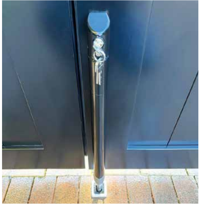
Electric shoot bolt for increased security

You have to think about how you want to let your visitor/contractor back out if you have let them in. Your hand held remotes can be used, or you could always dial the GSM intercom to let them out.