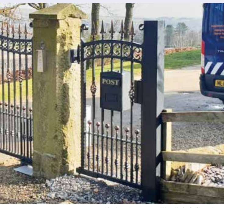
Pedestrian gate with a built in letterbox

Every system comes complete with hand held remotes, these remotes are encrypted and have to programmed via some special software here at our offices before they can work. This also means that if you require additional remotes, there isn't a callout charge to program them up! And if you lose your remote, you can contact us and we send out a replacement. When you receive your new remote, as you press the button it automatically deletes the old remote (you do need to make note of the number of each remote). We can also offer video intercom systems complete with internal tablets and touch screen monitors.