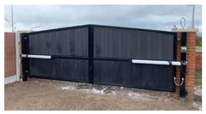
▲ Swing gates with above ground automation