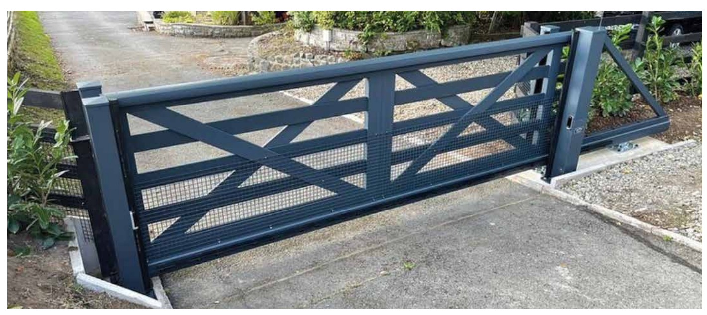
▲ A traditional five barred design made into a sliding gate