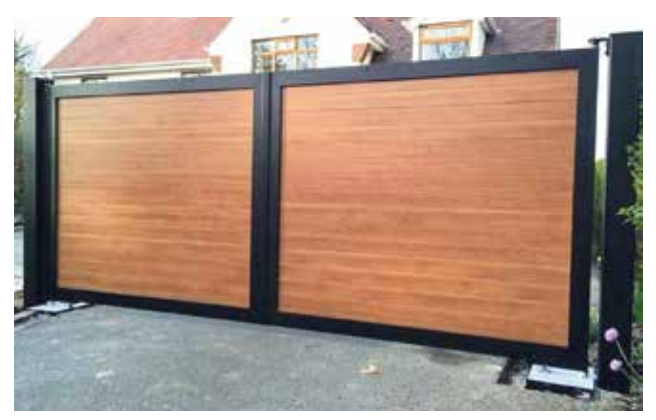
Aluminium gates with underground operators

All the sliding gate operators used are designed for commercial or industrial usage. They have the option for pedestrian opening, so only open 1-1.2m before timing out and closing.