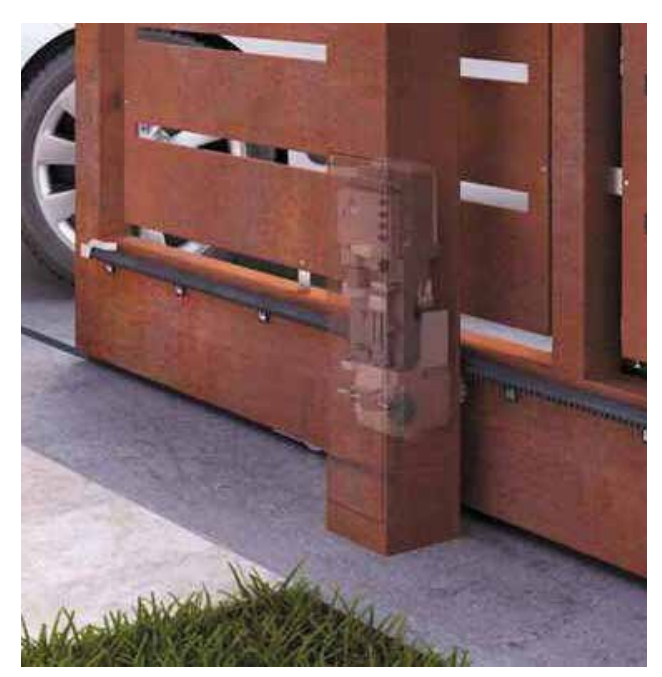
For sliding gates, we can install hidden motors

Depending on the design and size of the gates, we also fit magnetic locks with a holding force of 600kg, assisting with keeping them locked in the closed position.