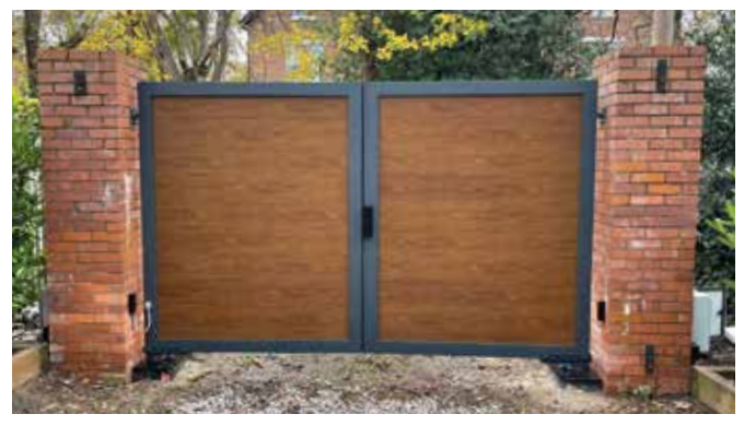
Grey frame with wood effect boards