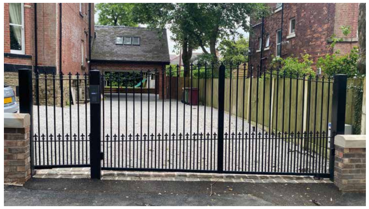
▲ Single leaf ornate gate with sloping bottom rail