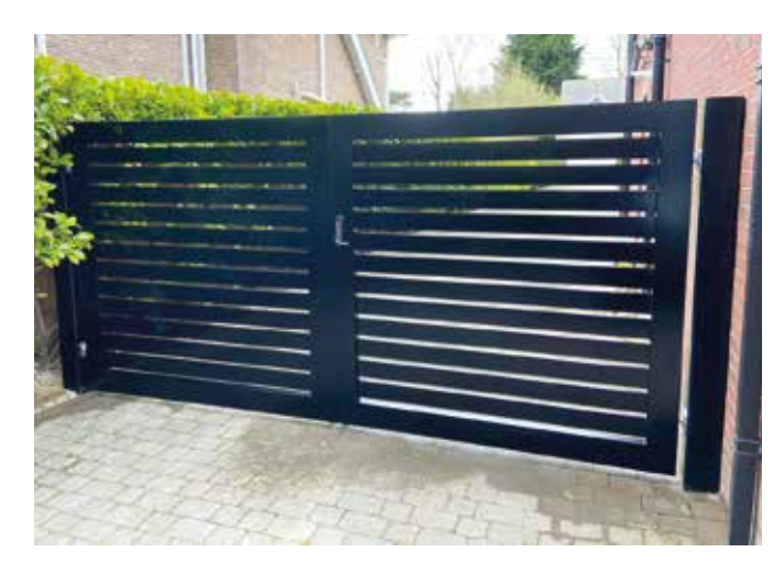
Aluminium gates with open sections