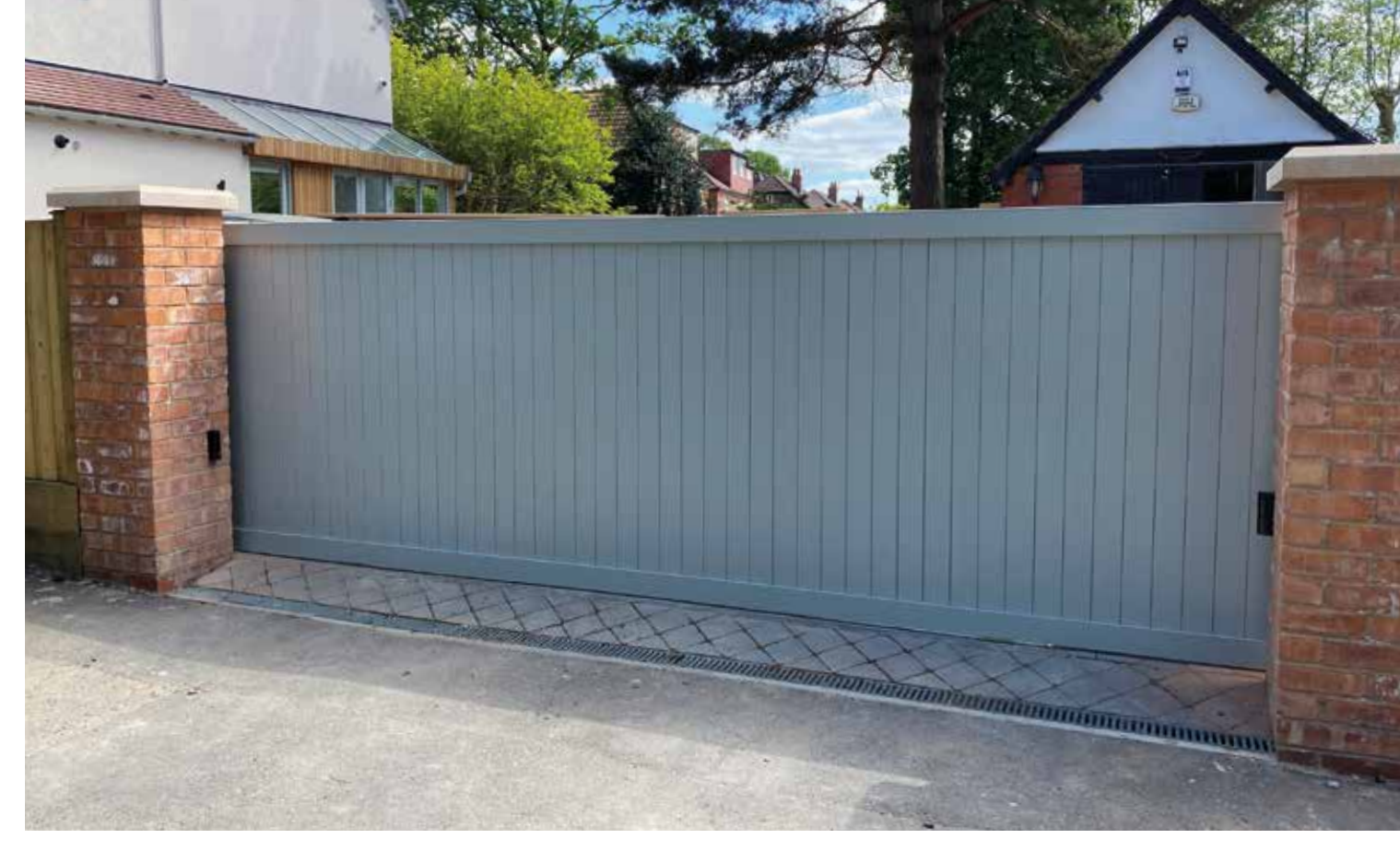
Bottom tracked aluminium sliding gate, powder coated to match the new doors and windows.