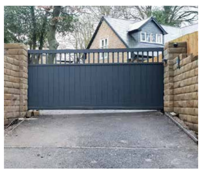
Top open section and bottom boarded

We would check the ground levels of your entrance and draw up a design, showing the maximum opening, clearance gaps for your approval/comments prior to manufacture.