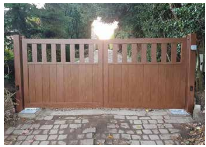
▲ Posts can also be wood effect