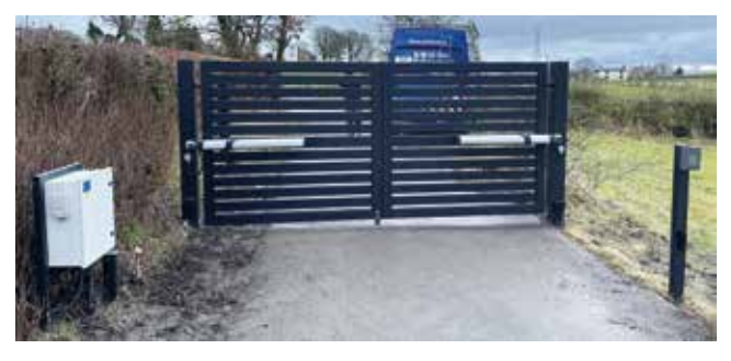
Swing gates with above ground automation