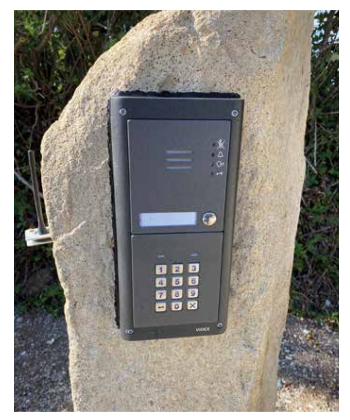
Videx GSM Intercom with backlit keypad