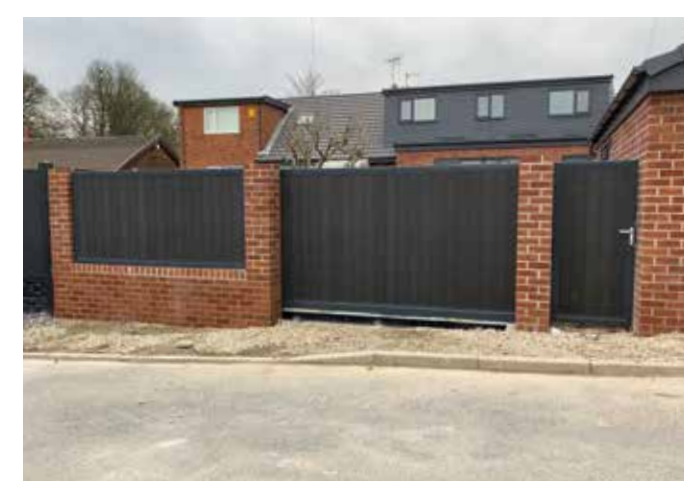
▲ Grey frame with wood effect boards

▲ Inside view of the gate showing the track