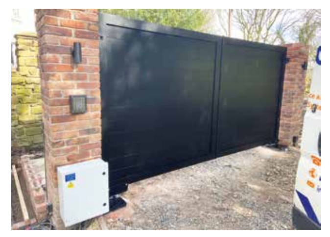
Swing gates with underground operators