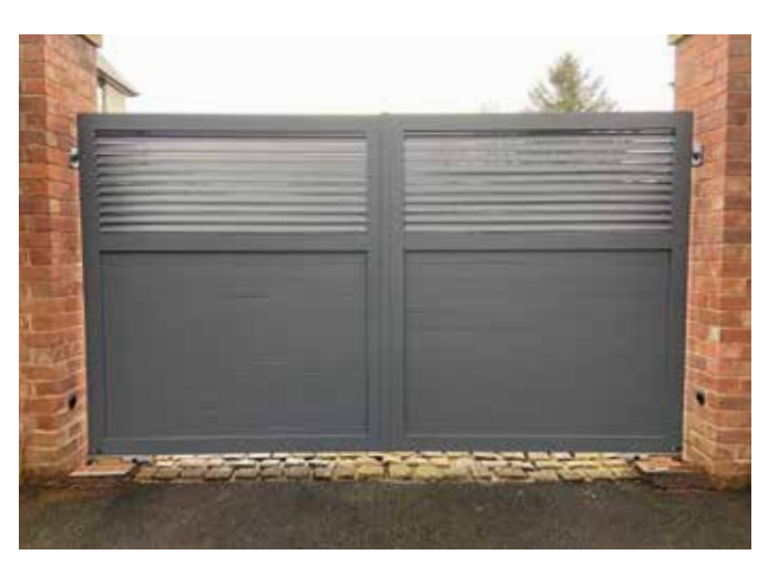
▲ Gates with louvred infill.