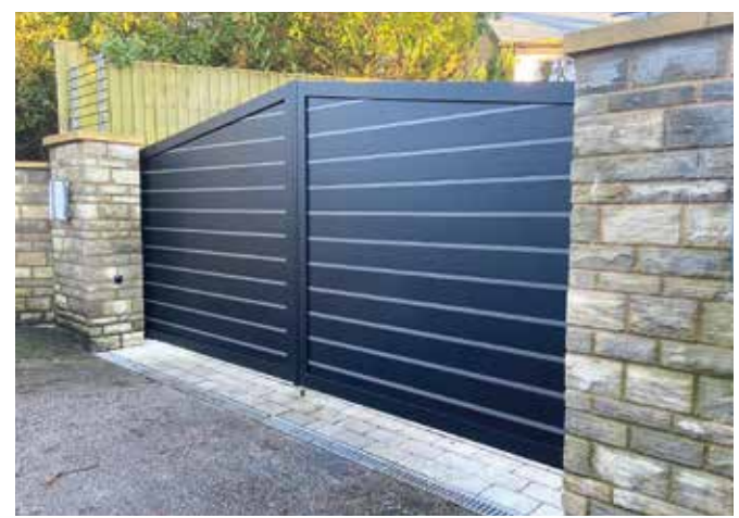
▲ Gates with a silver trim detail